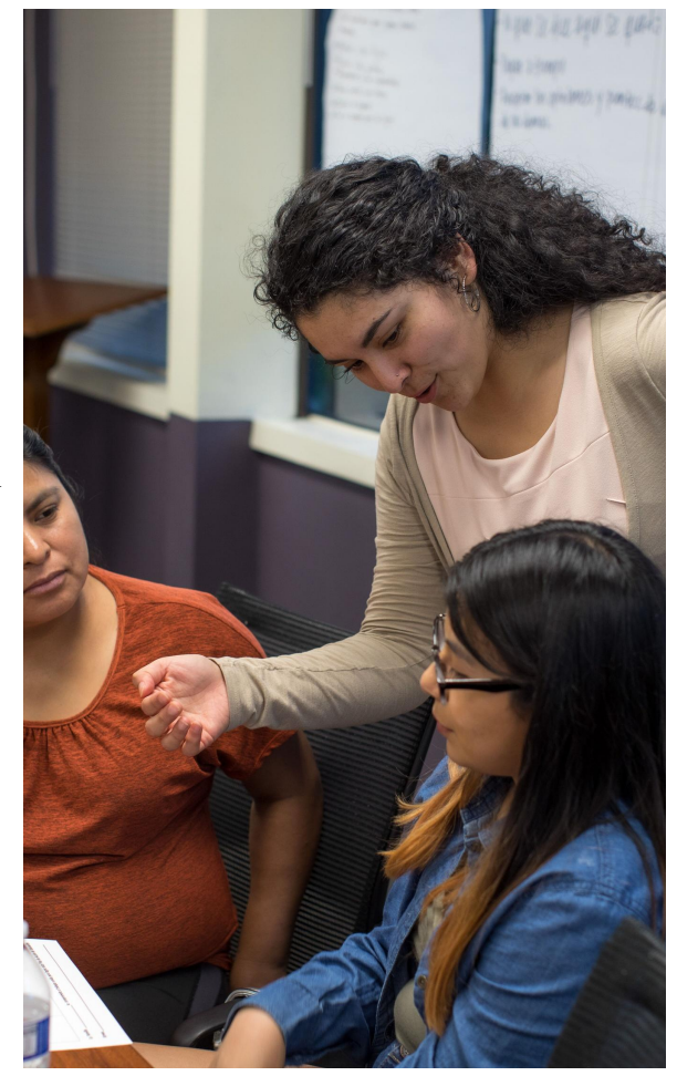
Juntos - College Access Program Workshop

Jefferson County Sheriff 's Office Mexican Consulate Atlanta Raymond James Rubio Law Firm Total Skin and Beauty Youth Serve